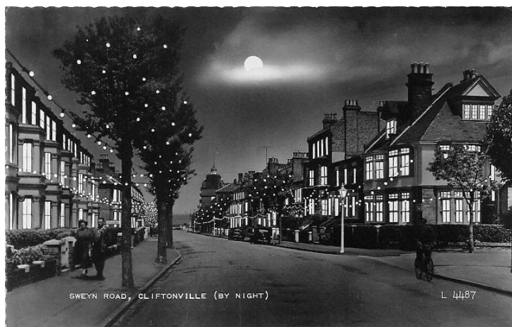
Above: Sewyn Road, Cliftonville

THE COMMITTEE OF THE MARGATE CIVIC SOCIETY WOULD LIKE TO WISH ALL OUR MEMBERS A VERY HAPPY CHRISTMAS AND A PEACEFUL NEW YEAR