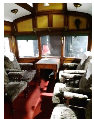
Left: BR Intercity class 47 and, right, officers' saloon coach from 1903 with luxurious interior.