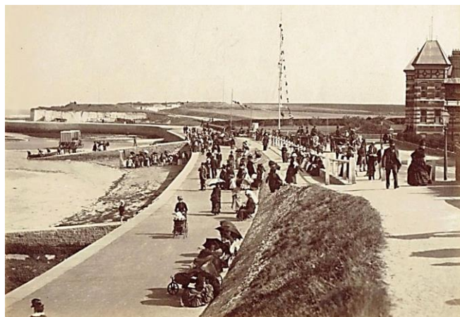
Above: St Mildred's Promenade in 1897