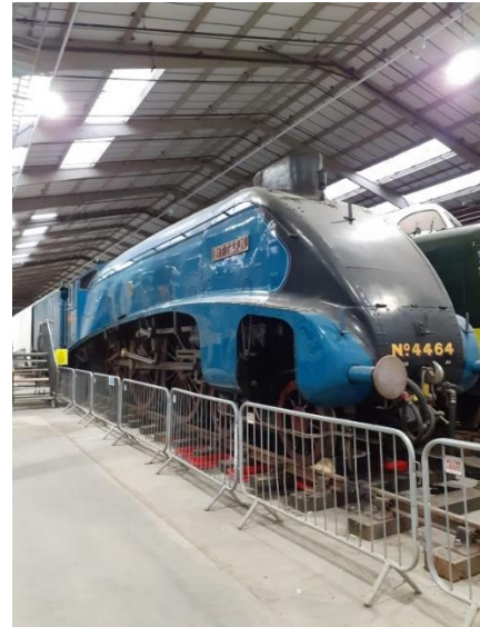
Bittern, sister engine to Mallard – the world steam record holder of 126 mph set on 3 rd July 1938