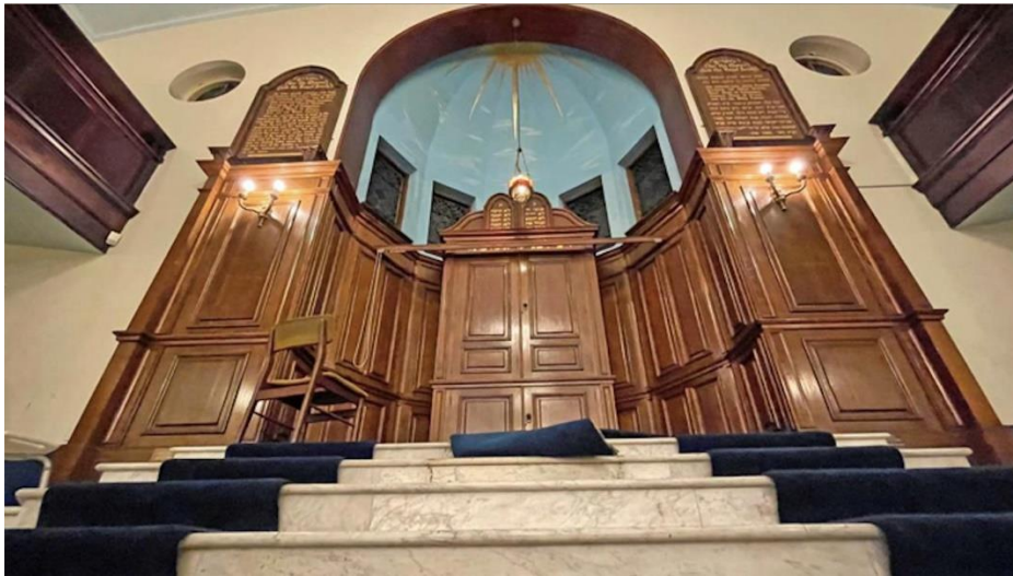
Above: The Margate Hebrew Congregation's Synagogue, 1929, Godwin Road, Cliftonville

After an absence of half a century I recently revisited the Margate Synagogue in Godwin Road, Cliftonville, the house of worship where at age 13 I was Bar Mitzvah'd.