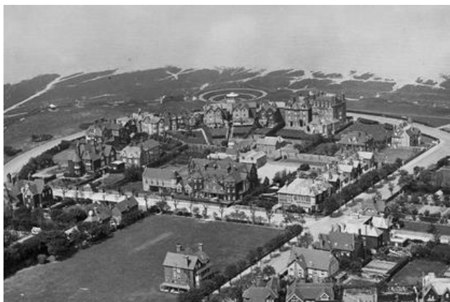
Above: Wellington House School with the playing field and masters' house in the foreground