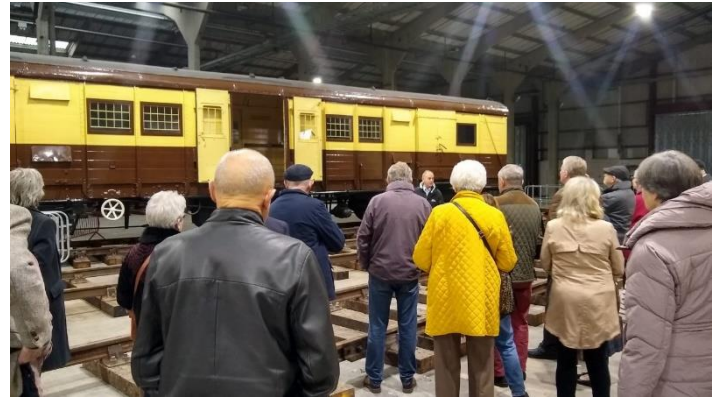
The Churchill hearse attracted much interest