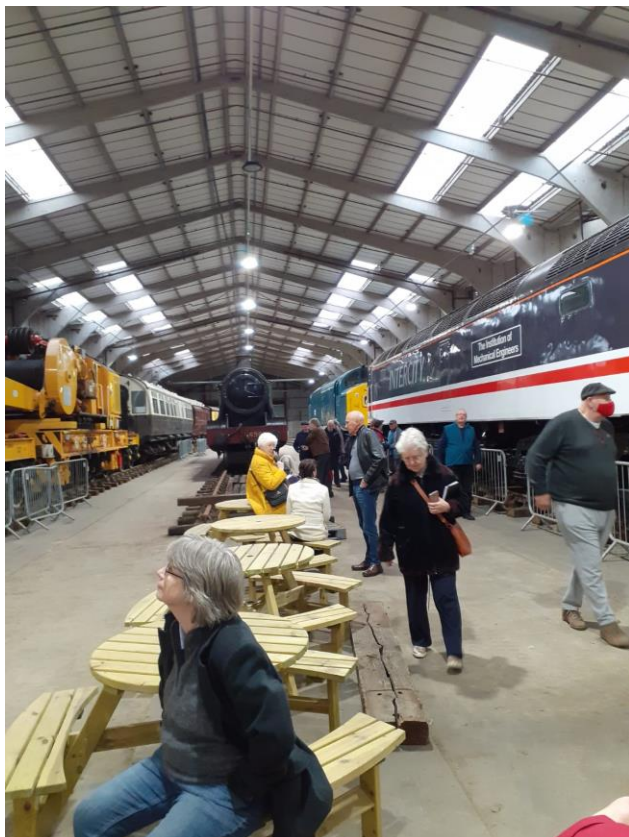
Members had free time to enjoy the exhibits