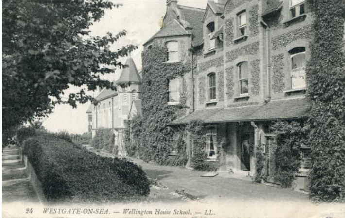
Above: Wellington House School in Rowena Road

One of the busiest mornings in Westgate-on-Sea was probably just before Christmas, when the boarding schools (very prominent in the town from the late 1880s onwards) were breaking up and the boys going home. This was usually around the 21 st December each year.