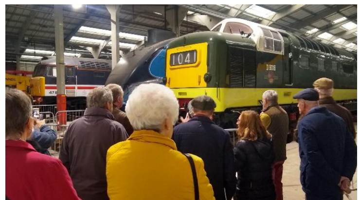
Admiring Deltic D9016