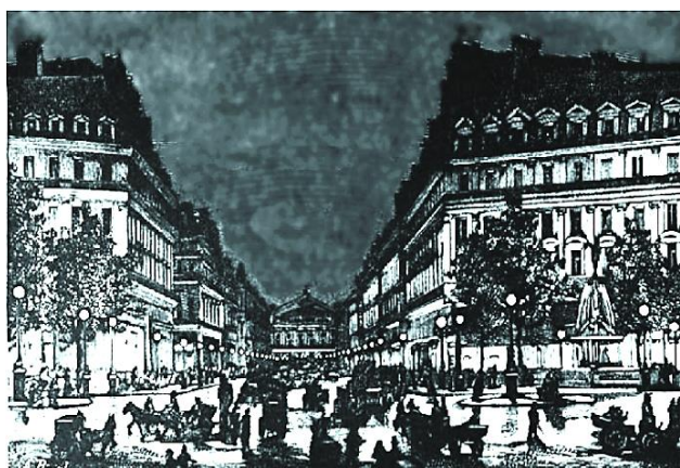
Above: The experimental electric lights in Paris