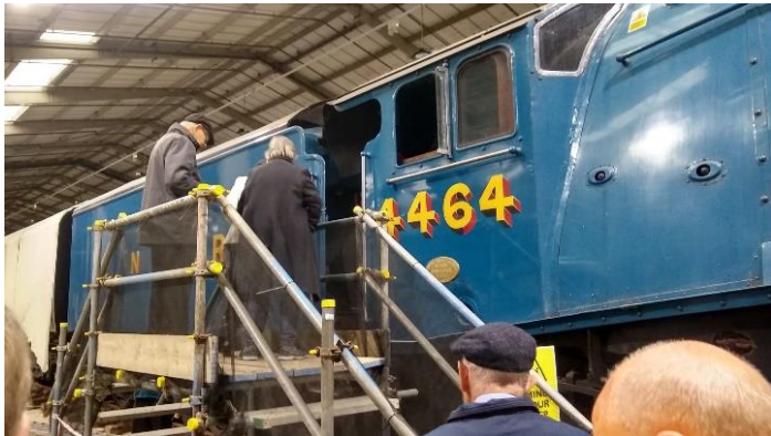
Members were able to look into Bittern's cab