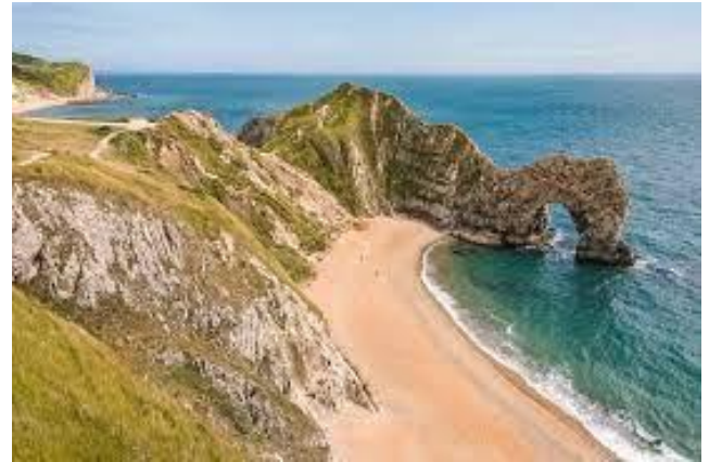
Above: Durdle Door, Dorset

met up with a couple of girls who were staying in a caravan, and we were invited to stay the night with them. Very friendly!